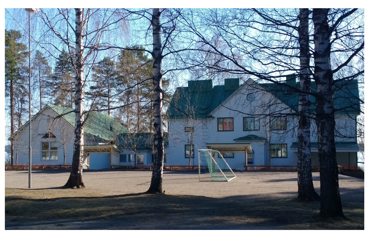
Muuratsalo Elementary School, the Competition Centre

Long Distance Race Jyväskylä, Finland, September 6th-7th 2014