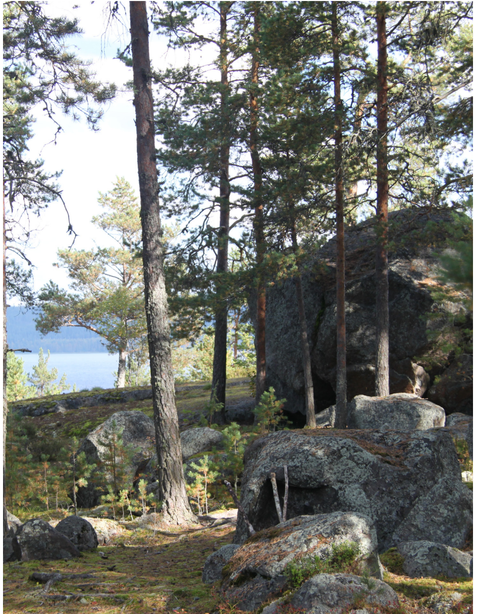
Paljaspää hill on Muuratsalo

Whether you take a train or a bus, at Jyväskylä you will arrive at the travel centre. There are taxis to take at the travel centre and the local buses leave from the nearby station. Here ( http://www.jyvaskylanliikenne.fi/etusivu/24etusivu/923-briefly-in-english ) you can find local bus timetables in English. From Jyväskylä city map you can see the distance from the travel centre to your hotel ( http://www.kartta.jkl.fi/IMS/en/Map ).